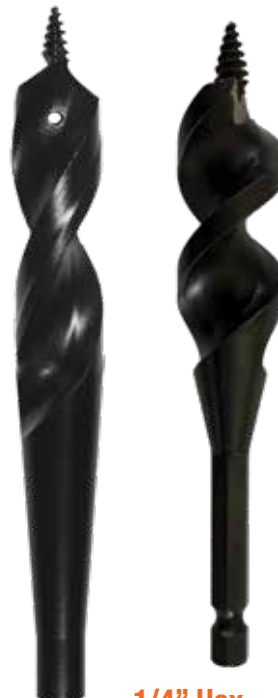
1/4" Hex Shank Drill Bit